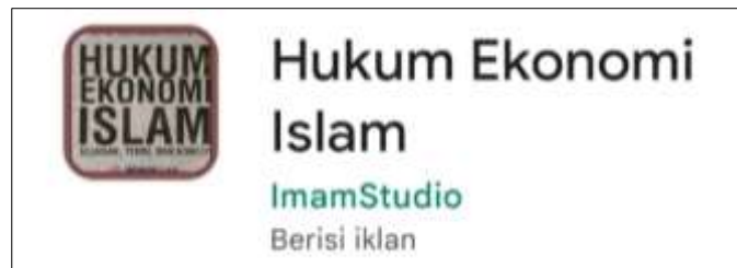
Figure 2. Menu Display of the Ekonomi Islam Application